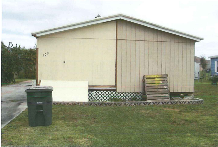
FRONT VIEW 02/01/16

If using the Elevation Certificate to obtain NFIP flood insurance, affix at least 2 building photographs below according to the instructions for Item A6. Identify all photographs with date taken; "Front View" and "Rear View"; and, if required, "Right Side View" and "Left Side View." When applicable, photographs must show the foundation with representative examples of the flood openings or vents, as indicated in Section A8. If submitting more photographs than will fit on this page, use the Continuation Page.