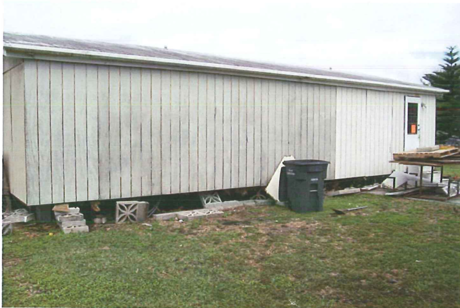
RIGHT SIDE VIEW 02/01/16