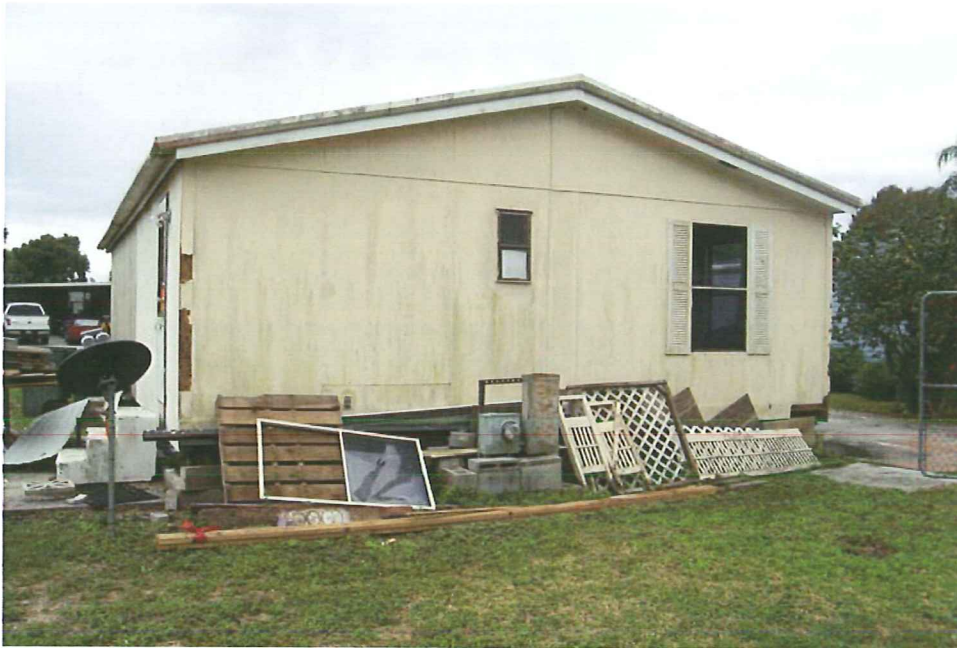
REAR VIEW 02/01/16

If submitting more photographs than will fit on the preceding page, affix the additional photographs below. Identify all photographs with: date taken; "Front View" and "Rear View"; and, if required, "Right Side View" and "Left Side View." When applicable, photographs must show the foundation with representative examples of the flood openings or vents, as indicated in Section A8.