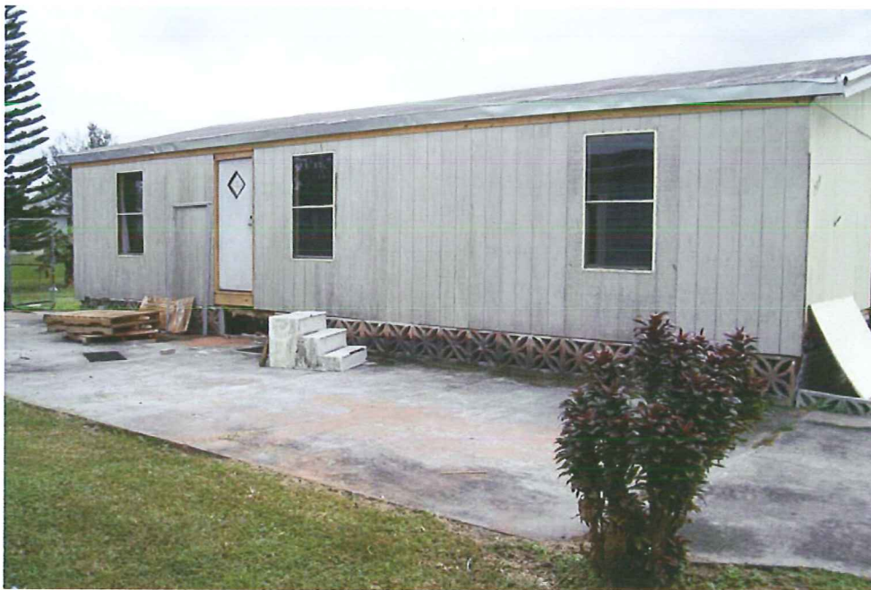
LEFT SIDE VIEW 02/01/16