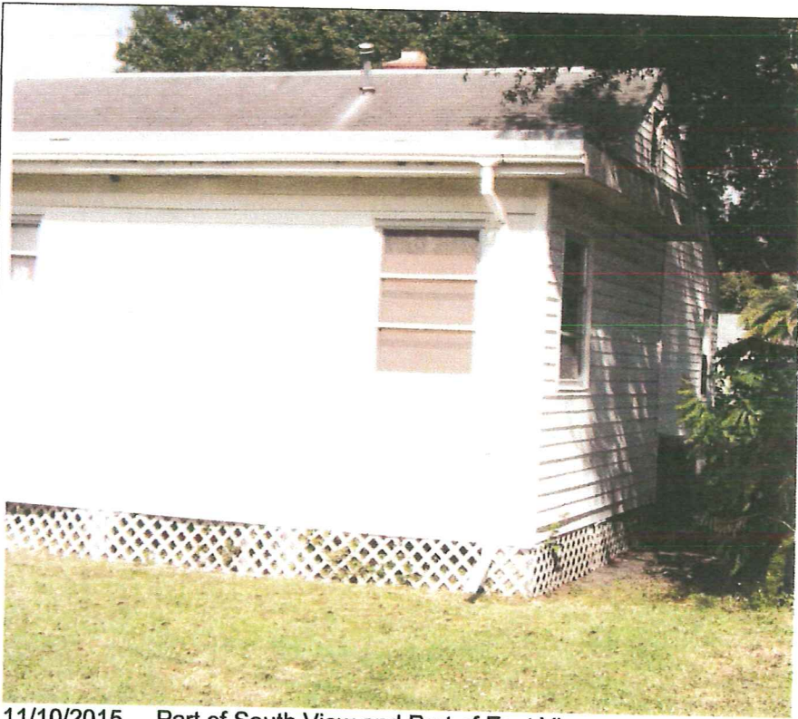
11/10/2015 Part of South View and Part of East View 11/10/2015 Part of East View and Part of North View