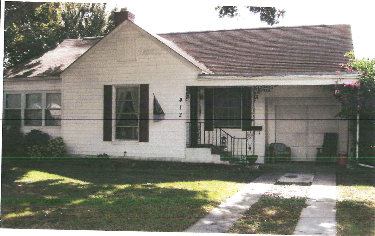
11/10/2015 North View

If using the Elevation Certificate to obtain NFIP flood insurance, affix at least 2 building photographs below according to the instructions for Item A6. Identify all photographs with date taken; "Front View" and "Rear View"; and, if required, "Right Side View" and "Left Side View." When applicable, photographs must show the foundation with representative examples of the flood openings or vents, as indicated in Section A8. If submitting more photographs than will fit on this page, use the Continuation Page.