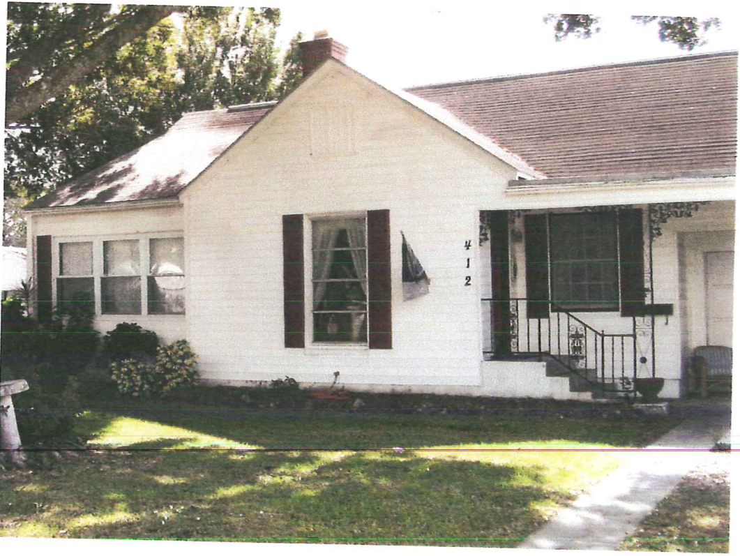
11/10/2015 North View

If submitting more photographs than will fit on the preceding page, affix the additional photographs below. Identify all photographs with: date taken; "Front View" and "Rear View"; and, if required, "Right Side View" and "Left Side View." When applicable, photographs must show the foundation with representative examples of the flood openings or vents, as indicated in Section A8.