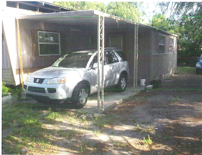
RIGHT SIDE VIEW 08/18/15