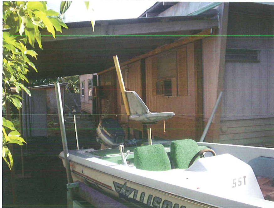
LEFT SIDE VIEW 08/18/15