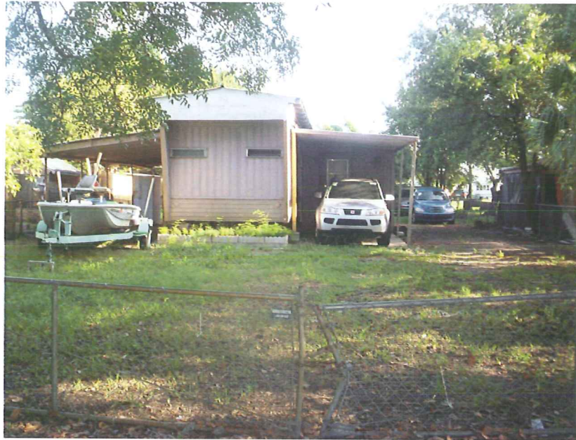
FRONT VIEW 08/18/15

If using the Elevation Certificate to obtain NFIP flood insurance, affix at least 2 building photographs below according to the instructions for Item A6. Identify all photographs with date taken; "Front View" and "Rear View"; and, if required, "Right Side View" and "Left Side View." When applicable, photographs must show the foundation with representative examples of the flood openings or vents, as indicated in Section A8. If submitting more photographs than will fit on this page, use the Continuation Page.