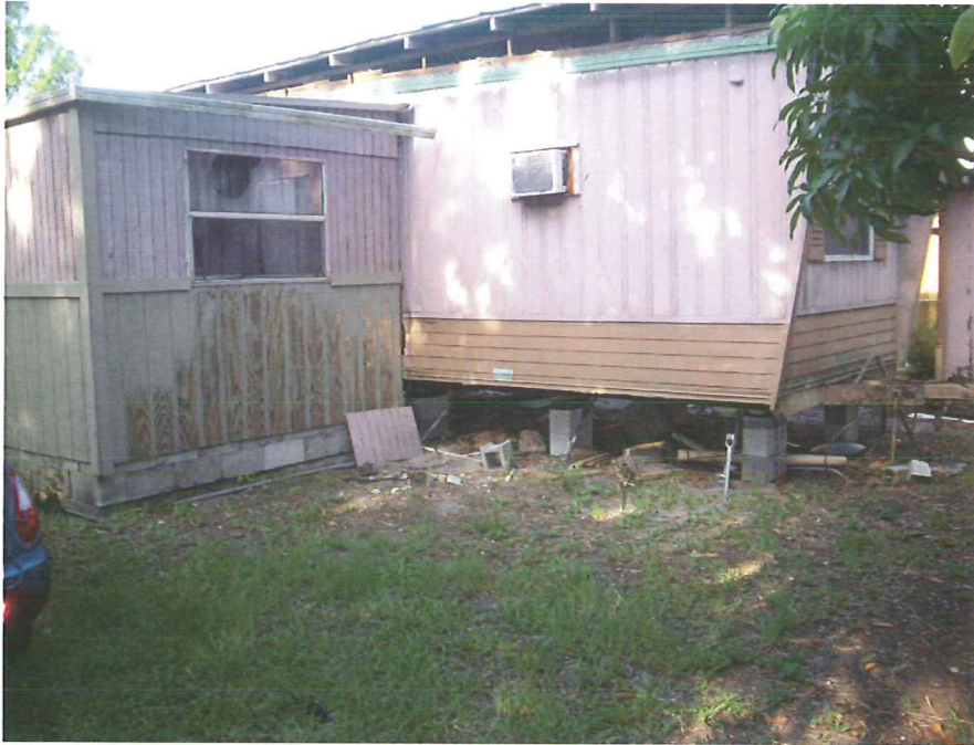
REAR VIEW 08/18/15

If submitting more photographs than will fit on the preceding page, affix the additional photographs below. Identify all photographs with: date taken; "Front View" and "Rear View"; and, if required, "Right Side View" and "Left Side View." When applicable, photographs must show the foundation with representative examples of the flood openings or vents, as indicated in Section A8.